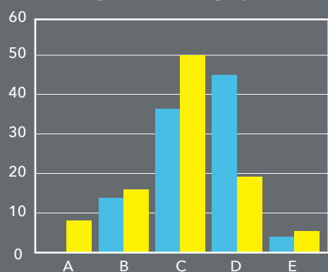
GRAPH 1: ENGLISH