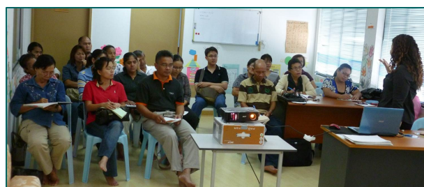
Training & Development... Teaching Staff undergoing Training & Sharing Session

= RM36,000-00 per annum = RM3,000-00 per month