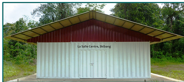
La Salle Centre, Skibang... Two 20-footer containers were modified and housed under one roof to make three classrooms.

There are five centres in the rural areas: La Salle Centre, Apar; La Salle Centre, Singai; La Salle Centre, Sibuluh; La Salle Centre, Skibang and La Salle Centre, Stass.