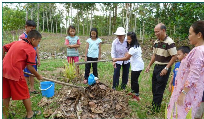
Holistic Education... Learning About Working with Nature

Learning Programmes aim to enable children with different learning abilities to catch up with normal classes.