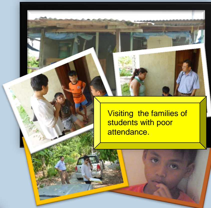
Visiting the families of students with poor attendance.