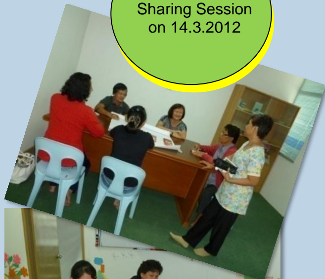
YLK Teachers Sharing Session on 14.3.2012