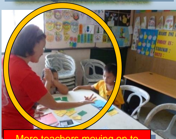
More teachers moving on to hands-on teaching approach.