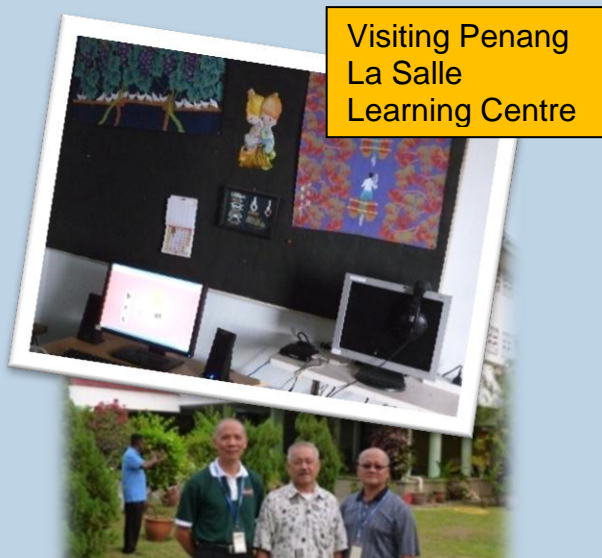
Visiting Penang La Salle Learning Centre